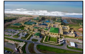
Kerkner's Mazagan Resort & Casino Casablanca, Morocco