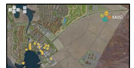
King Abdullah University (KAUST) Kingdom of Saudi Arabia